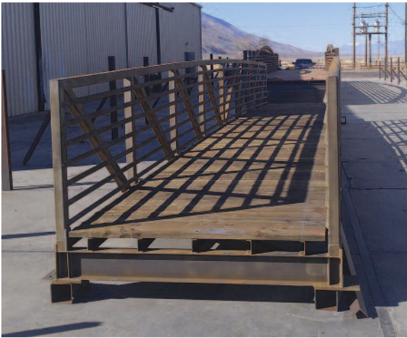
The bridge, which will span Tenmile Creek, will be installed in April.